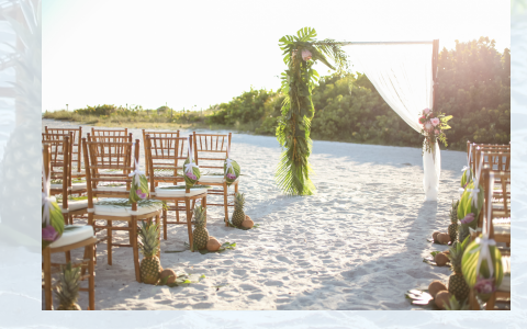
7 BEACH The #1 beach in the United States could be the backdrop of your special day as you say "I Do" with your toes in the sand. With enough space for up to 10,000 guests, our beach can accommodate a wedding of any size.

5 EXECUTIVE BOARDROOM The boardroom offers a large conference table and comfortable chairs for 10–15 people. Just because it's called the boardroom doesn't mean you have to host a corporate event—this room is also ideal for Fantasy Football draft days and other small gatherings. Let us help you close out the day with a cocktail hour and dinner. ( Up to 15 guests )