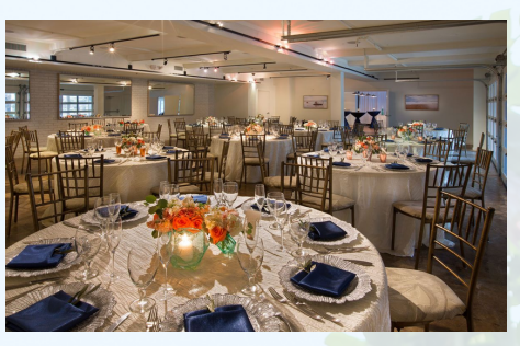
2 THE GARAGE This large space features a slick, industrial-chic look and is appropriate for all-day use, as we can reconfigure the seating for sit-down meals or cocktail receptions. The 1,450-square-foot room can be customized in any way needed for large-group sessions and breakout activities. ( Up to 40 guests )