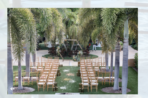
6 GARDEN COURTYARD Host outdoor gatherings for up to 200 guests in this festive venue. Strung lights and lanterns adorn the trees and provide a captivating atmosphere for evening events. With 5,616 square feet, the courtyard is just right for product launch parties, company picnics, and holiday events.