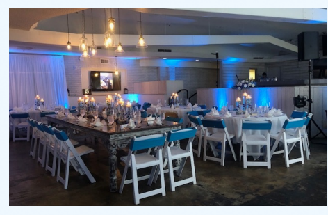
1 BEACH HOUSE The Beach House is a space built for entertaining. Gather round the built in bar for a fun cocktail. White washed ship lap and sea themed lighting create a fun atmosphere to celebrate and feast the night away.