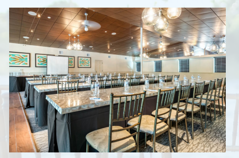
4 SUNSET BALLROOM This 2,280-squarefoot space comes complete with an expansive terrace, and the interior room has an open floor plan. Discuss last month's metrics or brainstorm next month's marketing strategies within a tranquil environment. ( Up to 150 guests )